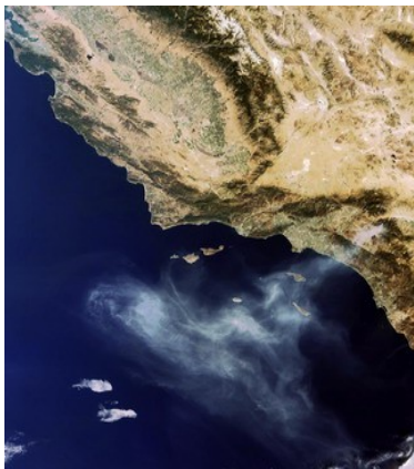
Figure 1. -- Envisat satellite --

The detection systems of wildfires through images collected by satellites are the most novel. Both NASA and the European Space Agency are using this technology in their detection projects.