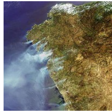
Figure 2.-- Envisat satellite --

Figure 1 taken by Envisat satellite. The image corresponds to a forest fire occurred in California.