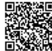
Figure 3. QR code to view a traditional dance.