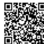
Figure 4. QR code with an audio of a traditional dance.