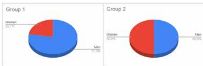
Figure 2. Sex of the sample.

The sample was divided into two groups, respecting each student's class-group. In consequence, non-equivalent groups were formed, one corresponding to morning classes and the other to afternoon classes, in order to avoid that the results be conditioned through the direct contact of the groups (Imhoff & Brussino, 2019; Laher & Kramer, 2019; Montero & León, 2007).