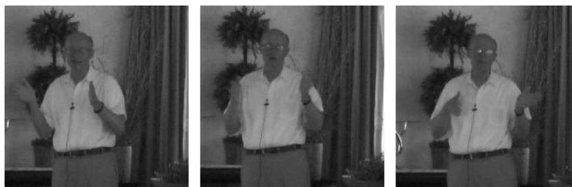
Figure 5. Gesture co-expressed with can get