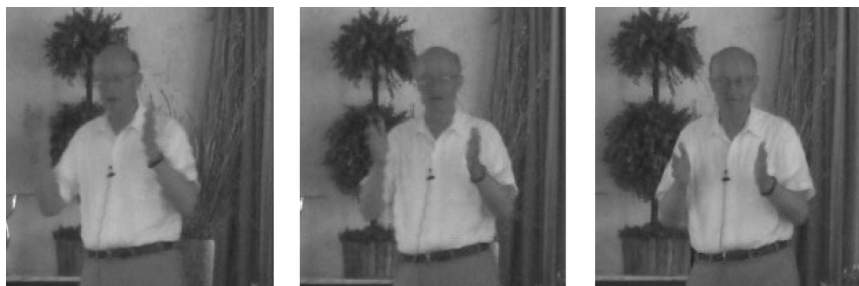
Figure 4. Gesture co-expressed with very tightly

The presenter opens the response with a general comment on the particularity of the species. He intensifies the adverb tightly with very . The whole utterance very tightly finds semantic synchrony with an iconic gesture of bringing palms up closer to each other (the palms have been positioned facing each other at the beginning of the sentence), as illustrated in Figure 4.