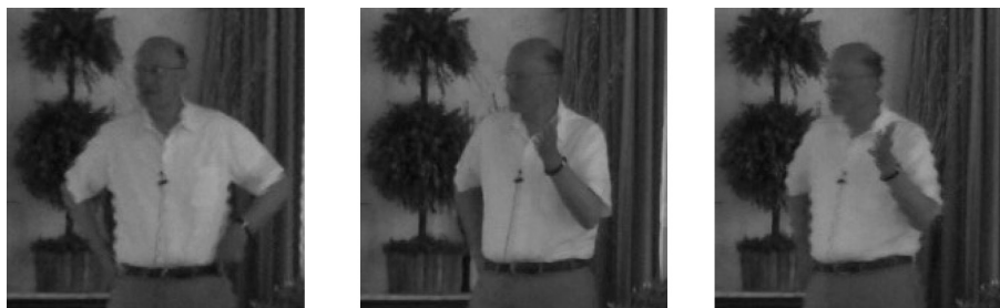
Figure 3. Gaze and gesture co-expressed with good

The first move taken by the presenter is Opening the turn . This move can be realised in two ways either by showing his reaction to the question or by repeating the question. In the example, the presenter chooses the first option. He appreciates positively the question with the adjective good . The presenter faces forward questions. Thus, his reaction might be seen as evaluating the difficulty implied in the question and judging also positively the discussant. This interpretation gains force with the examination of the gestures and expressions that co-express with the utterance. The presenter points out the discussant with palm up and looks at the audience. It is as if the expression of attitude were addressed to the audience and the discussant gained a higher position among them. See the kinesic expression in Figure 3.