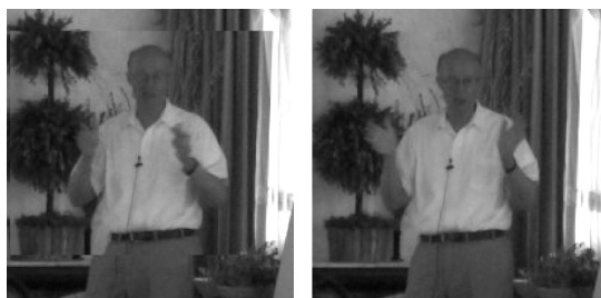
Figure 7. Head movement and gesture co-expressed with huge

The presenter describes the results of the second experiment with positive appreciation. The verb turns out to be shows they have a particular result especially one that they did not expect. This verb is intensified with palms up moving forward. Nonetheless, the positive polarity of the verb is achieved with the description of the results as the same number , which shows similar findings in both experiments. The utterance the same is intensified phonetically with loudness up and with a quick nod. The presenter closes the move taking up the positive answer shown in the straightforward response in Example 6. He has expressed it with negative self-judgement of capacity we've been trying to do (Example 4). Now, he opens the expression of this rhetorical function once more with self-protection of positive face. The presenter reintroduces the idea that he is talking about on-going work. The temporal adverb still intensifies the idea of continuity, which co-occurs with palms up moving forward. Then, he shows a positive attitude towards the experiments with the inscribed appreciation by using interesting intensified with very . He grades binding isotope effects with huge that co-occurs with a gesture of separating palms up, an iconic gesture that shows semantic synchrony with the verbal utterance.