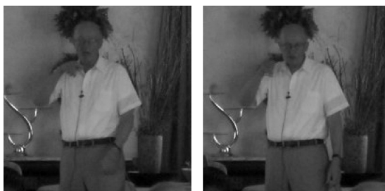
Figure 6. Head movement and gesture co-expressed with can also