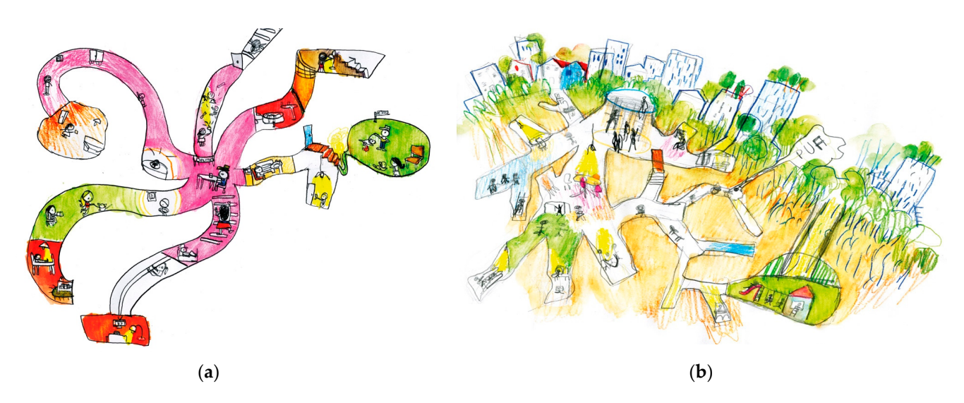
Figure 6. Different drawings of the underground air-raid shelters in the city of Alicante, made by students from the public school La Aneja de Alicante: (a) drawing of the interior of an air-raid shelter; (b) drawing of an air-raid shelter in a public square. Self-made.