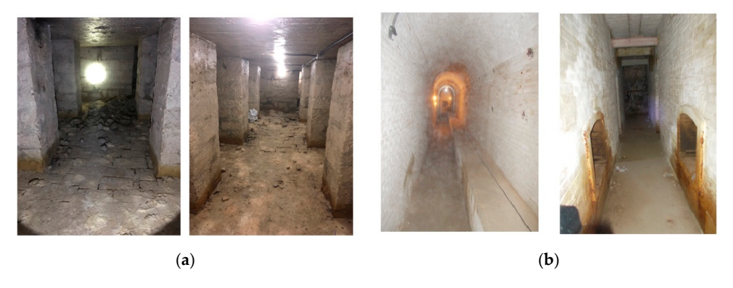
Figure 1. Air-raid shelters in the EDUSI area: (a) photographs of the interior of the R35 Marvá Promenade shelter; (b) photographs of the interior of the R69 Tobacco Factory shelter.

Under the ERDF (European Regional Development Fund) Operational Program "Sustainable Growth 2014–2020", the Alicante City Council implemented the Integrated Sustainable Urban Development Strategy (EDUSI) "Las Cigarreras Area" for sustainable urban development, co-financed by the European Commission. This project focused on the rehabilitation of air-raid shelters from the Civil War in various neighborhoods, improving their accessibility and contributing to cultural and touristic revitalization. The EDUSI, aligned with the ERDF Thematic Objective 6 (recovery of former industrial, religious, and military spaces), seeks to protect and develop cultural and natural heritage. With a budget of EUR 600,000 and a five-year timeline, the project included the rehabilitation of shelters and activities to reconstruct Historical Memory, aiming to increase sustainable tourism and improve cultural heritage. The first phase involved the planning of the opening and accessibility to six shelters in the Alicante DUSI area. Figure 1.