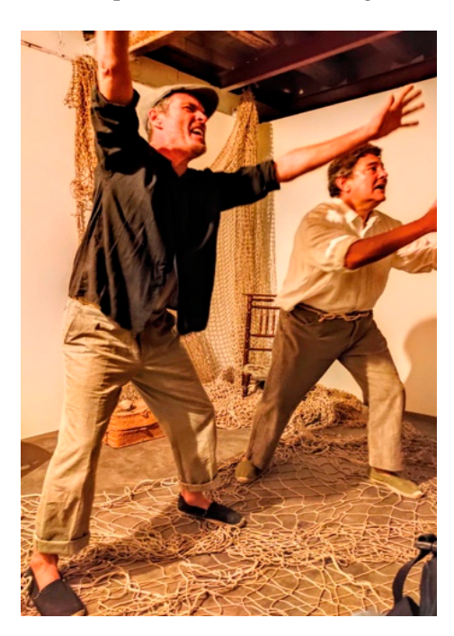
Figure 4. Micro-theatre in the anteroom of the tobacco factory air-raid shelter, performed by Vicente de Ramón Producciones. Self-made.

Specific events have taken place within the rehabilitated shelters, including theatre, music, poetry, dance at Tabacalera, and architectural performances at Marvá. These activities are part of a strategy to enrich the cultural and educational experience, diversifying artistic expressions and enhancing historical heritage (Figure 4).