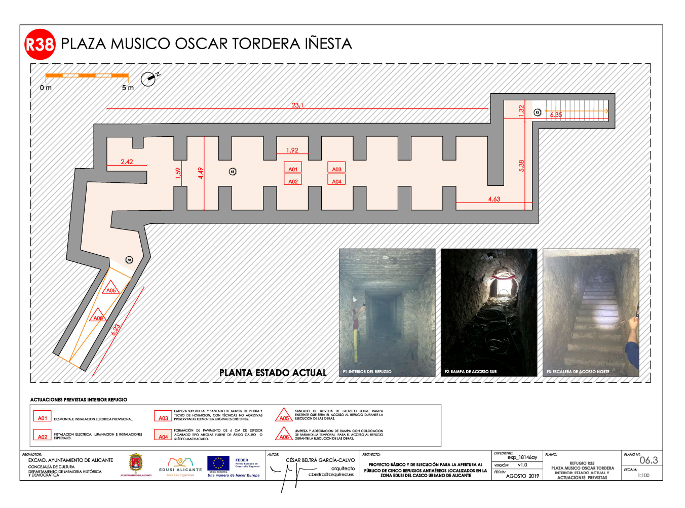
Figure 2. Air-raid shelters in the EDUSI area: photographs of the interior of the R38 Músico Tordera Square shelter and its layout.

The justification for calculating the area eligible for rehabilitation was developed in several stages. Initially, the first project estimated an intervention in a total area of 544~\text{m}^2 . Subsequently, this calculation was adjusted in the modified project, which considered an area of 432.36~\text{m}^2 , to which an extension of 35~square meters was added due to an opening in Marqués de Molins, resulting in a total of 467.36~\text{m}^2 . In addition, an extra surface not initially documented in Padre Mariana, of 378.64~\text{m}^2 , was identified, raising the total to 846~square meters.