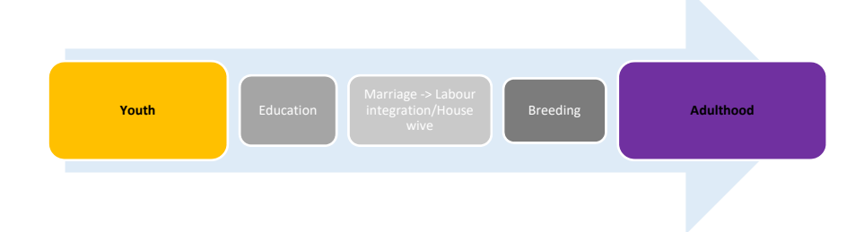
Figure 1. Linear transition. Source: own elaboration based on the study by Du Bois-Reymond and Blasco [36].

The observation of youth life courses during the industrial era also played a significant role. The period of preparation necessary to ensure the proper use of new machinery to guarantee the productivity and competitiveness of a company increased significantly in comparison with the professional profiles of previous stages. This transition from youth to adulthood was explained based on a linear model (Figure 1), as it was made up of a series of irreversible and cumulative events that ultimately led to adult status. This model was characterised by a sequencing of age-based events such as education, employment/household work, marriage, and the birth of children. Men were seen as the workers and economic providers of households, and women were responsible for the care of the households and the offspring [27,36].