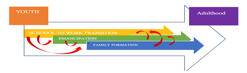
Figure 2. Traditional transitions according to Coles' [39] model.

In this way, the author explained that traditional transitions should be understood as the interplay of three highly interconnected transitions, namely, (1) the school—work transition, characterised by the shift from full-time study to work as the main occupation; (2) the domestic transition, which took place in the move from the family of origin to the family of destination, created by marital ties; and (3) the residential transition, which took place through emancipation from the family home [39]. This interrelation can be observed in Figure 2. The status achieved in any one of these transitions determined and was determined by the status of the remaining transitions. Thus, as he explained, a young person experiencing homelessness (the residential transition) would find his or her chances of starting a family (the domestic transition) or finding a job (the school-to-work transition) to be highly affected [40].