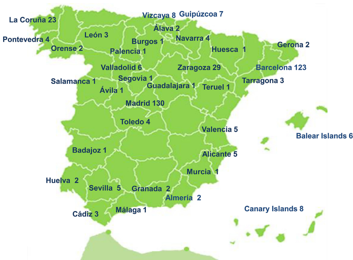
Figure 2. Geographic distribution of HTLV-1 cases reported in Spain. HTLV-1; Human T-lymphotropic Virus-1