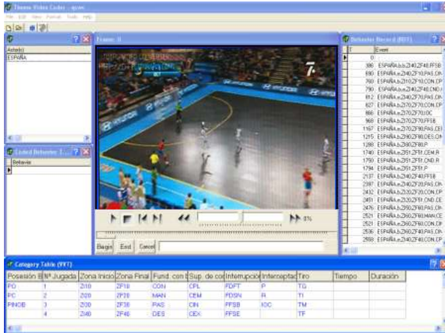
Image 3. Screenshot of the ThemeCoder registration tool (Own creation).

Consequently, as a registration tool, the ThemeCoder programme has been used. The names of each one of the criteria of the created observation tool have been introduced into it, as well as the codes related to the corresponding categories -Image 3-. According to Bakeman (1978), the type of data used have been time-based and concurrent, in other words, it was type IV.