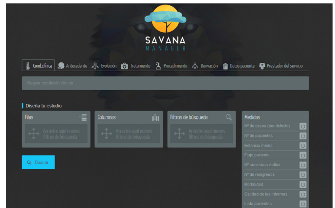
Fig. 3. Home screen of Savana Manager, all the information and configuration options appears in a simple way in only one screen.

support in Spanish, and is designed to be used at the time of the patient’s visit, in front of him/her (Figure 4).