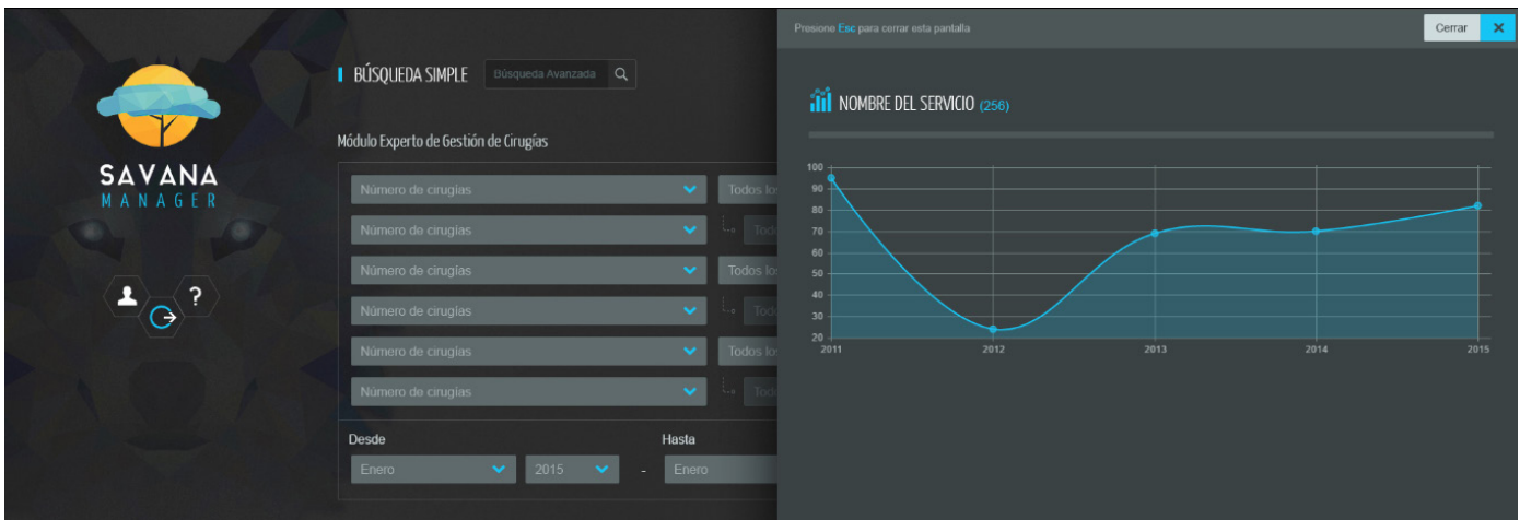
Fig. 2. Example of the control panel of Savana Manager.

for the output of the algorithm for a given query). Savana’s model, which is being used in several modules of our infrastructure, has been trained with over 500M Spanish words coming from EHRs, and enables the robot to decide, for instance, when ‘no’ refers to the negation adverb, and when it is an abbreviation of the medical concept ‘neuritis óptica’, depending on the contextual content. To the best of our knowledge, this is the largest embeddings model trained exclusively with EHRs.