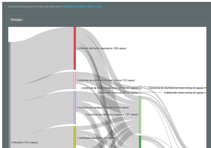
Fig. 6. Example output of Savana Research: It shows the most likely admittance of patients with diabetes mellitus (again, this information can easily be obtained with just one click).

private groups. Today, more than 3000 queries have been delivered to the different applications, by a total of 216 users.