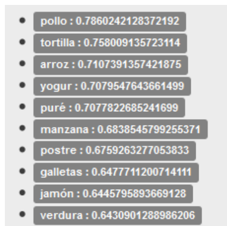
Fig. 1. Example of Savana's unsupervised learning model. It shows the result when asked for words semantically related to dieta sana .