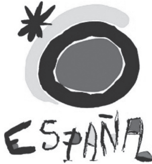
Figure 4 Logo of the Spanish tourist brand: The Sun of Miró.

on an international level. This was a breakthrough in Spanish marketing campaigns, mainly because it began its journey in the 80s and is currently still used in leading positions of brand image. The Miró logo is present in all the communication elements developed by TURESPAÑA and has become a hallmark of Spanish tourism.