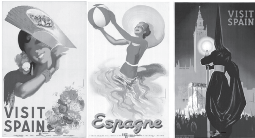
Figure 1 Examples of tourist posters from Spain in the 40s