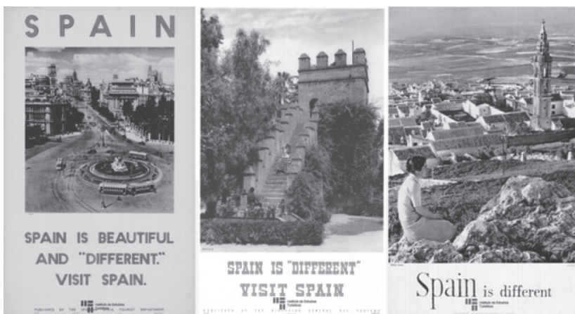
Figure 2 Examples of the campaign «Spain is different»

During the 50s, tourism in Spain began to grow rapidly and the Government created a first slogan that would become very popular, and that is still remembered to this day: « Spain is different » (figure 2). This new campaign, although it continued with cultural promotion, began to highlight sun and beach tourism, which was demanded from abroad at the time and, therefore, would turn into the only image that was projected for years to come.