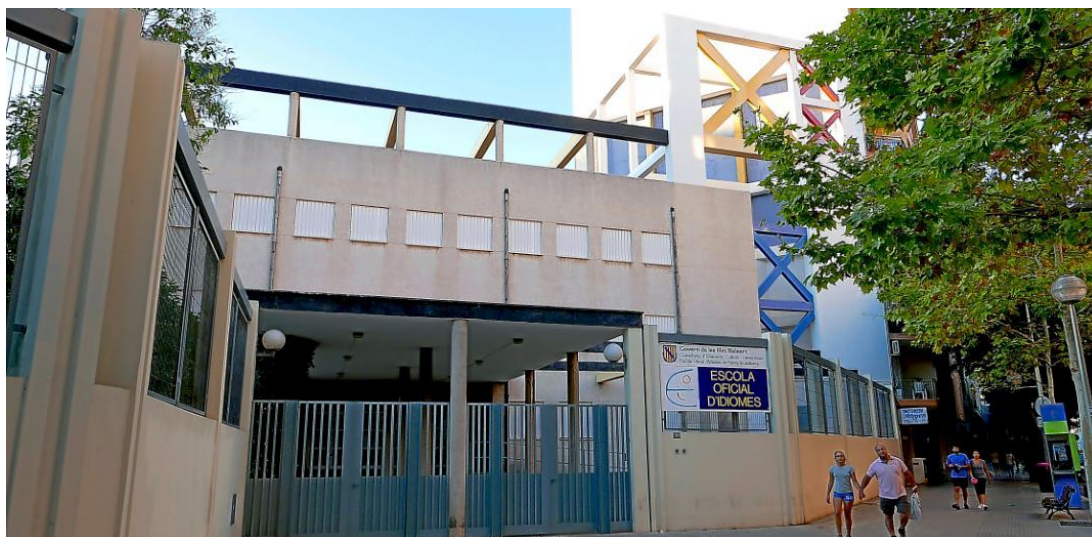
IMAGEN DE LA SEDE PRINCIPAL DE LA ESCUELA OFICIAL DE IDIOMAS DE PALMA.

Dos profesores interinos compiten por una plaza en Baleares. Uno de ellos tiene el Proficiency de la Universidad de Cambridge, es decir, el más alto en conocimiento de idiomas. Y el otro, estudió hace años tres cursos en la Escuela Oficial de Idiomas y cuenta con un B1. ¿Cuál de los dos tendrá más puntos por méritos idiomas? Sorprendentemente, el segundo, porque el primer profesor no tendrá ninguno. Y es que la Conselleria de Educación no acepta en su convocatoria de interinos ningún título de idiomas, salvo los conseguidos en las Escuelas Oficiales.