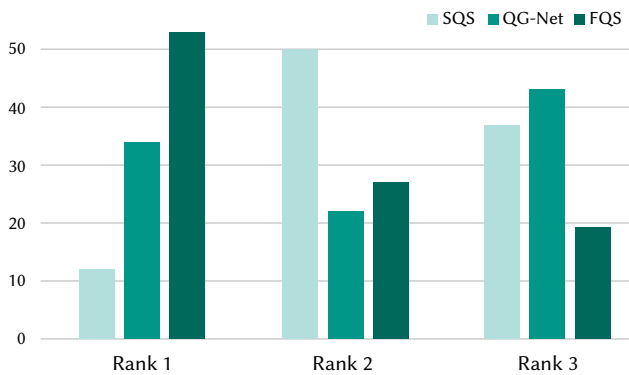
Fig. 3. Human ranking of preferred follow-up questions from followQG comparing with two other baseline models based on relevance and grammar. The bar indicates the frequency of rankings, indicating that the followQG model is the most preferred for highest ranking.

The findings can be seen in the Fig. 3. For each of the baseline and followQG, we calculate the frequency of the mode ranking for all three ranks. FQG model significantly outperforms (well beyond p=0.01 level) the other two models. With 54% of questions generated securing Rank 1, followQG is capable of high quality follow-up question generation. 34% of the questions generated by QG-Net obtain Rank 1. 50% of the questions from SQS secure Rank 2. It can be observed that the grammatically correct SQS selected questions are preferred second to the grammatically incorrect and somewhat relevant QG-Net model questions. We conclude that the FQG model, more frequently than the current baselines, produces valid and grammatically correct follow-up questions.